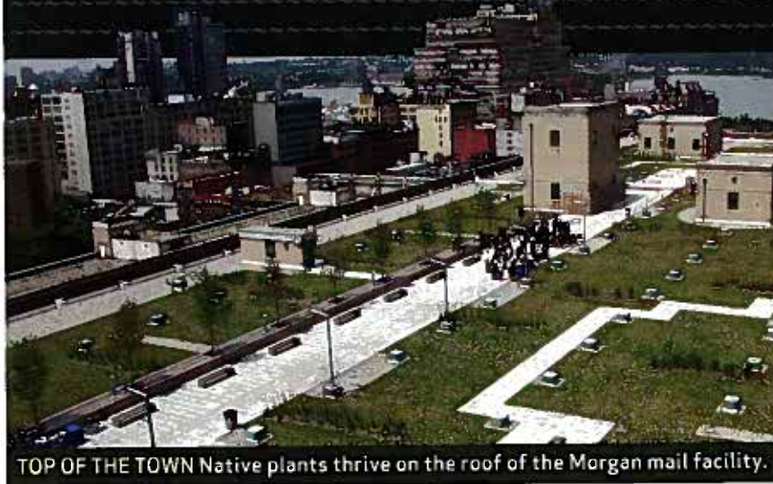
TOP OF THE TOWN Native plants thrive on the roof of the Morgan mail facility.